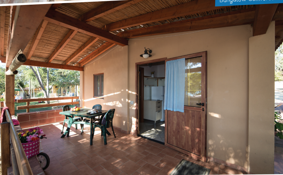
Bungalow Comfort Free