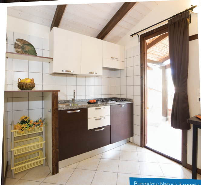
Bungalow Natura 3 people